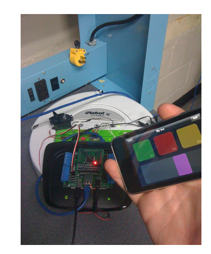
The iRobot with a Linksys wireless router and MAKE controller mounted on it for OSC capability over a Wi-Fi network.

<u>IPhone Simulator</u> - simulates the iPhone technology stack to test iPhone applications on an Intel–based Mac.